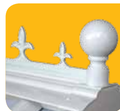
Ball finial and Shield cresting