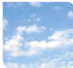
Self cleaning glass

How does it work? There are two processes. Firstly, the special coating harnesses the natural daylight which triggers the breakdown of the dirt and grime on the outside of the glass and secondly, when the rainwater hits the glass, rather than forming droplets, it