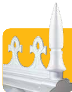
Global finial & Global cresting